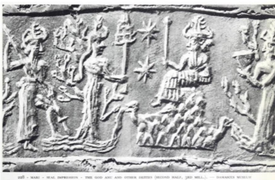
A Mari seal impression from the third millennium depicting the god Anu and other deities. 293