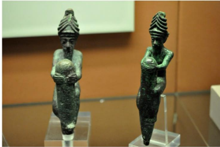
Copper-alloy foundation figures depicting ancient Mesopotamian gods wearing characteristic horned crowns (c. 2130 BC)

Sumer is the name of the ancient Mesopotamian civilization that preceded the Akkadian and Babylonian civilizations of the area now called Iraq. It is believed by many scholars to be the oldest civilization. Others contend that such honor should be given to Kemet (Egypt). I will not engage in that debate here, except to point out that both civilizations at least in part derive from or were influenced by the earlier civilizations of Afrabia (Black Arabia). 13 However, I will point out (and show below) that Sumer was a Black civilization.