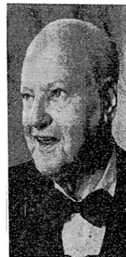
FOR GOLDWATER: H. L. Hunt, the oil millionaire.

He said Mr. Goldwater and Representative William E. Miller, his Vice-Presidential runningmate, fitted that description.